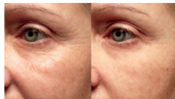
DAY 30† 15 minutes after applying Fill & Freeze

After 30 days, “my face looks younger and it makes my eyes look brighter!” GLORIA R.