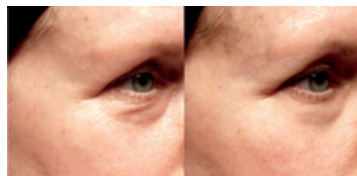
DAY 1 15 minutes after applying Fill & Freeze

After 30 days, “my face looks younger and it makes my eyes look brighter!” GLORIA R.